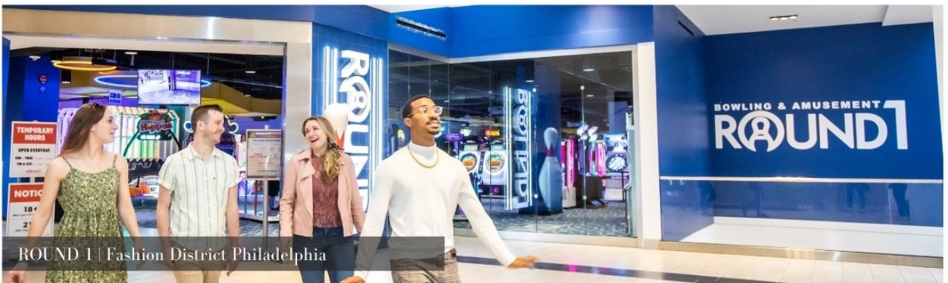
ROUND 1 | Fashion District Philadelphia