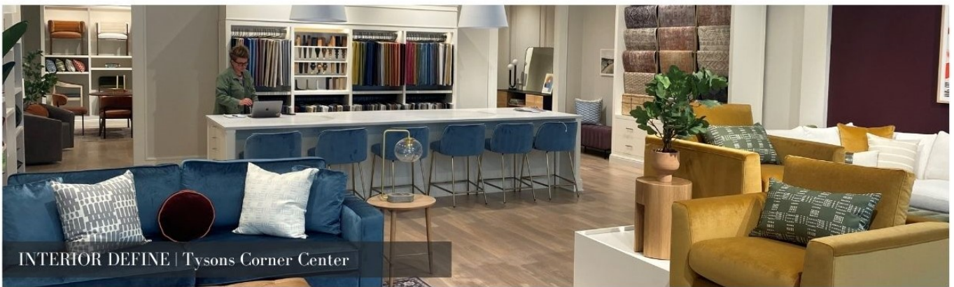
INTERIOR DEFINE | Tysons Corner Center