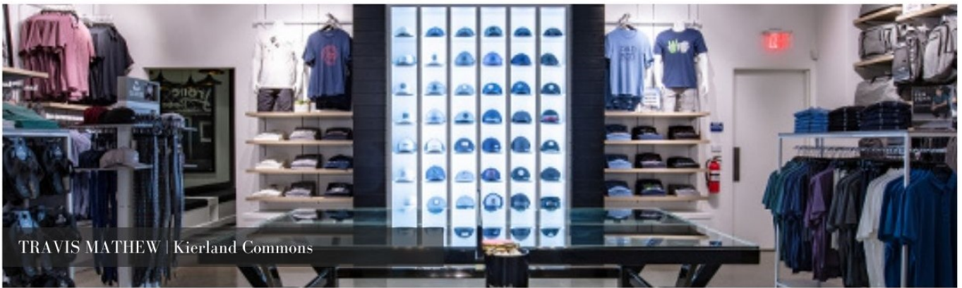
TRAVIS MATHEW | Kierland Commons