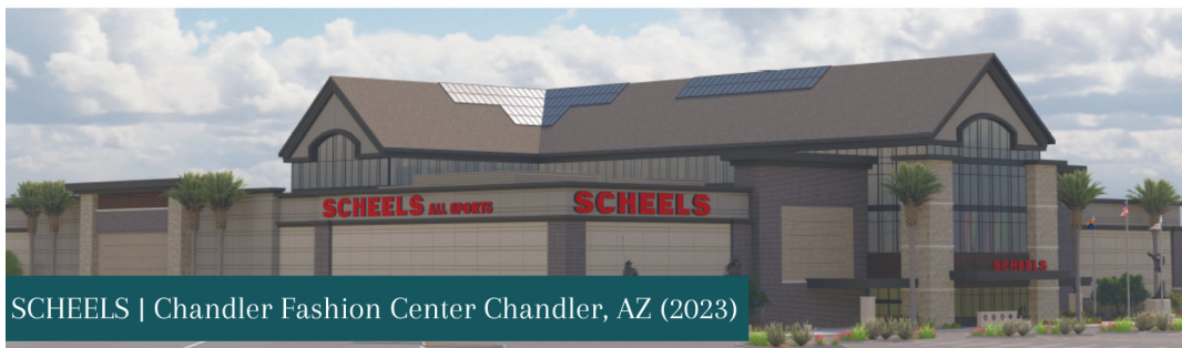
SCHEELS | Chandler Fashion Center Chandler, AZ (2023)