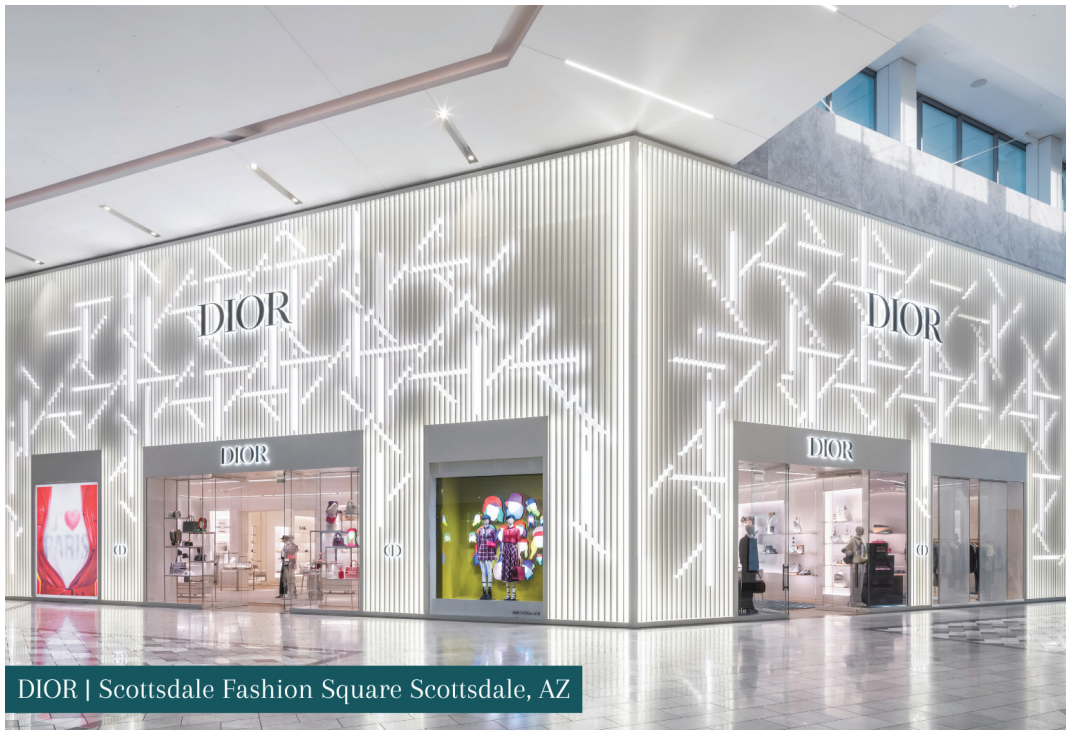
DIOR | Scottsdale Fashion Square Scottsdale, AZ