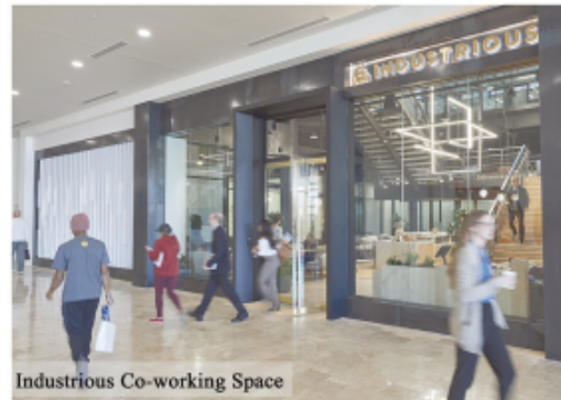
Scottsdale Fashion Square, Arizona